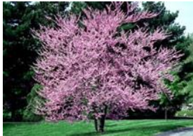
Eastern Redbud - $200.00