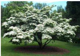
Dogwood - $200.00

As trees are fragile, living things, they are planted in the spring or fall when conditions are the best.