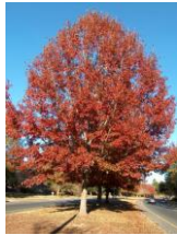
Red Oak - $250.00