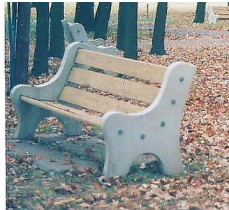
6' park bench - $425.00

When you order a commemorative bench you will discuss its location within the Lower Providence Township Parks System with the Parks & Recreation Director. Lower Providence Township must approve the wording and size on any plaques you wish to include on the bench.